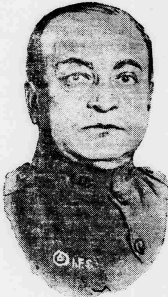
GOV-ELECT HENRY J. ALLEN OF KANSAS

Henry J. Allen, editor of the Wichita (Kansas) Beacon, has just returned to this country af- ter spending eighteen months on the American front as a Y. M. C. A. secretary to take up his duties as governor of Kansas. He was so busy with his "Y" duties that he did not return for the campaign and has the distinction of being the only absentee candidate ever elected in this country.