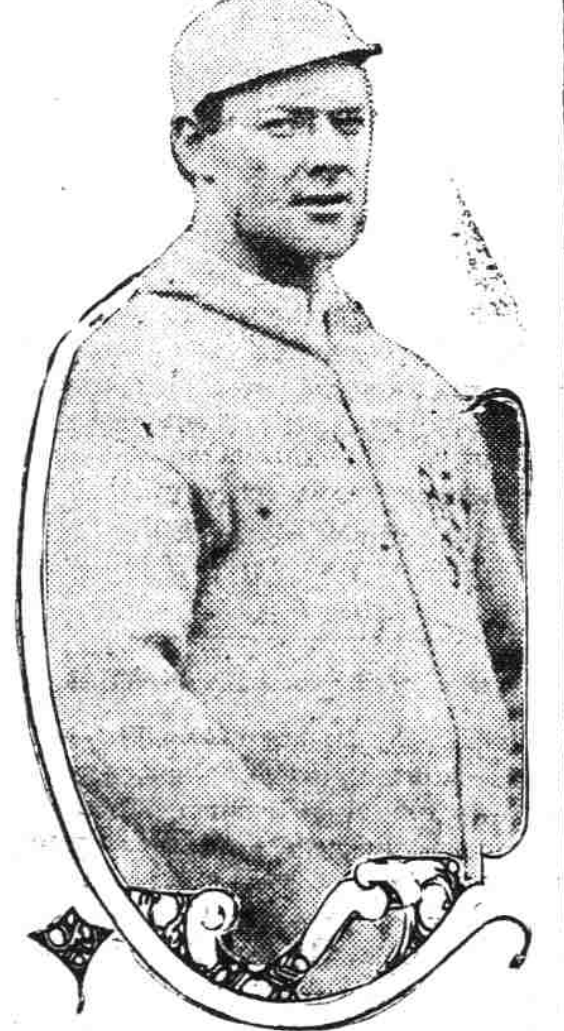
Forest Gady, the sterling young backstop of the Boston Red Sox, who is one of Bill Carrigan's most valuable aides in attempting the American League pennant, but humbled the New York Giants in the world's series.

RESULTS YESTERDAY. American League. At Cleveland 4; Chicago 2. At St. Louis 4; Detroit 2. National League. At Cincinnati 4; St. Louis 2. At Chicago 4; Pittsburgh 6. Federal League. At Indianapolis 5; St. Louis 3. American Association. At Columbus 6; Cleveland 4. At Minneapolis 5; Kansas City 3. At St. Paul 3; Milwaukee 8. At Indianapolis 4; Louisville 6. Second: Indianapolis 7; Louisville 1; (*innings.) Southern League. At Memphis 0; Nashville 1. At New Orleans 9; Montgomery 0.