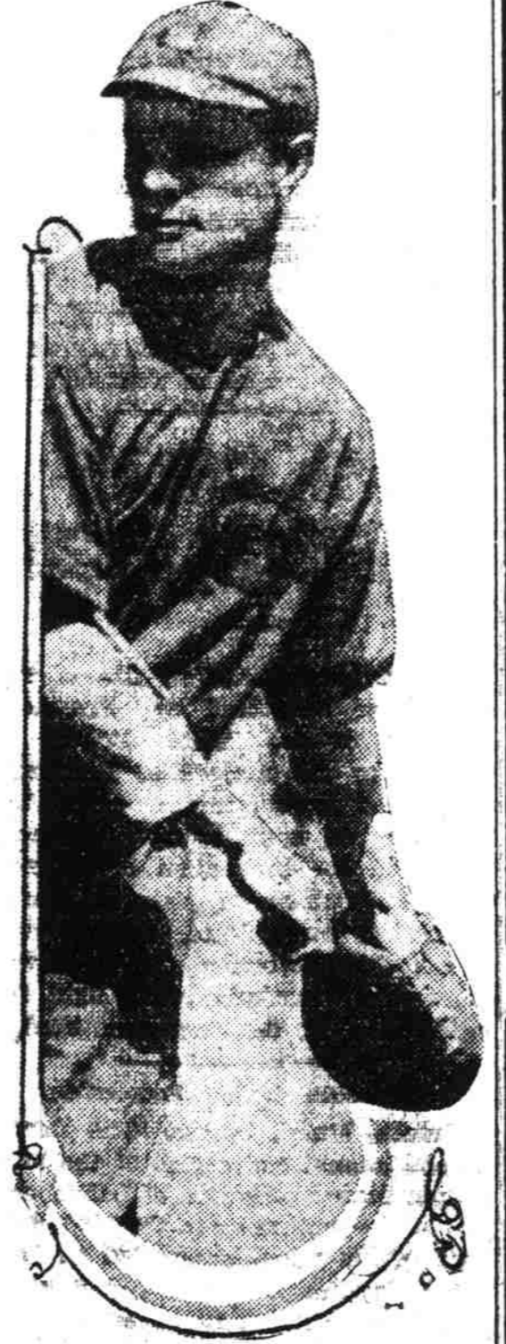
Dick Hoblitzel, the hard hitting first sacker of the Cincinnati Reds, whose work at bat and in the field has been one of the features of the great showing made by the Reds this year under the leadership of Manager Charles Herzog. When in New York on the last eastern trip Herzog was quoted as having confided that Hobby was his mainstay in transforming the Cincys into a winning combination.