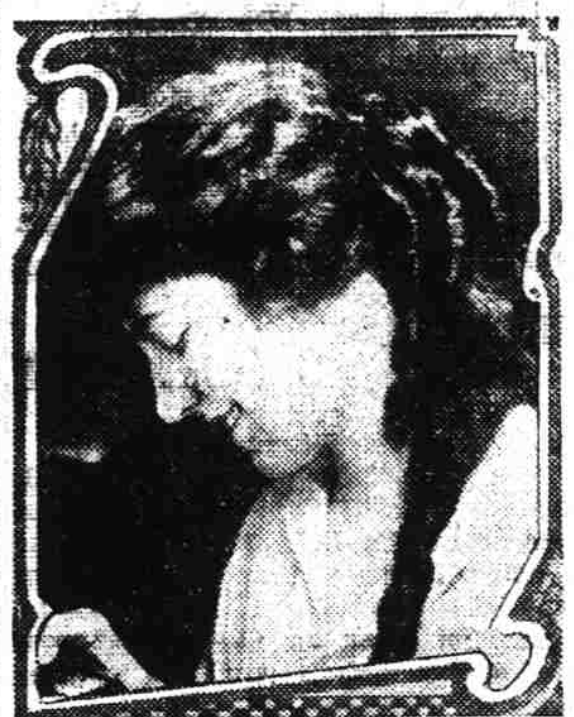
HELEN HOLMES Star in "The Girl and The Game," Grand Friday

depicts a poor Russian peasant girl and later is given opportunity to wear some of those remarkable gowns which fashion makers the world over have patterned after and raved over. Miss Suratt was seen on the local stage about six years ago, and drew one of the largest crowds that ever packed a local playhouse. She is all