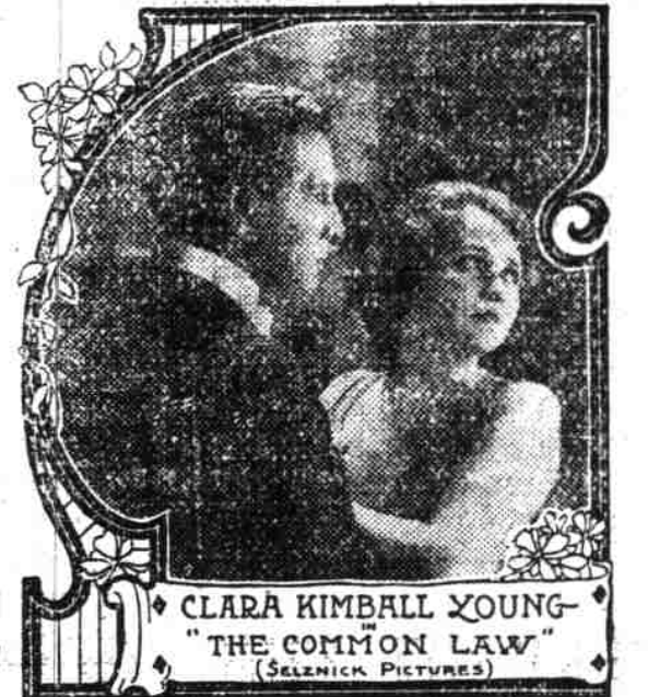
CLARA KIMBALL YOUNG "THE COMMON LAW" (Salem Pictures)