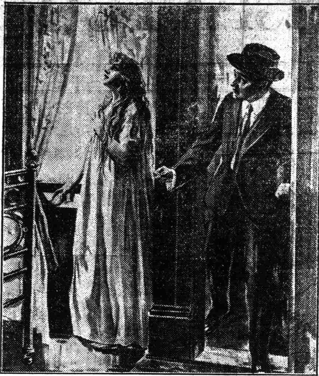
A Scene from "A Little Girl in a Big City," Academy of Music, Matinee and Night, Saturday, January 6.