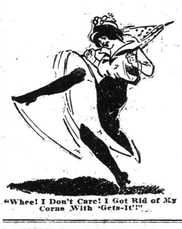
"Wheel! I Don't Care! I Got Rid of My Corns With 'Gels-It'!"