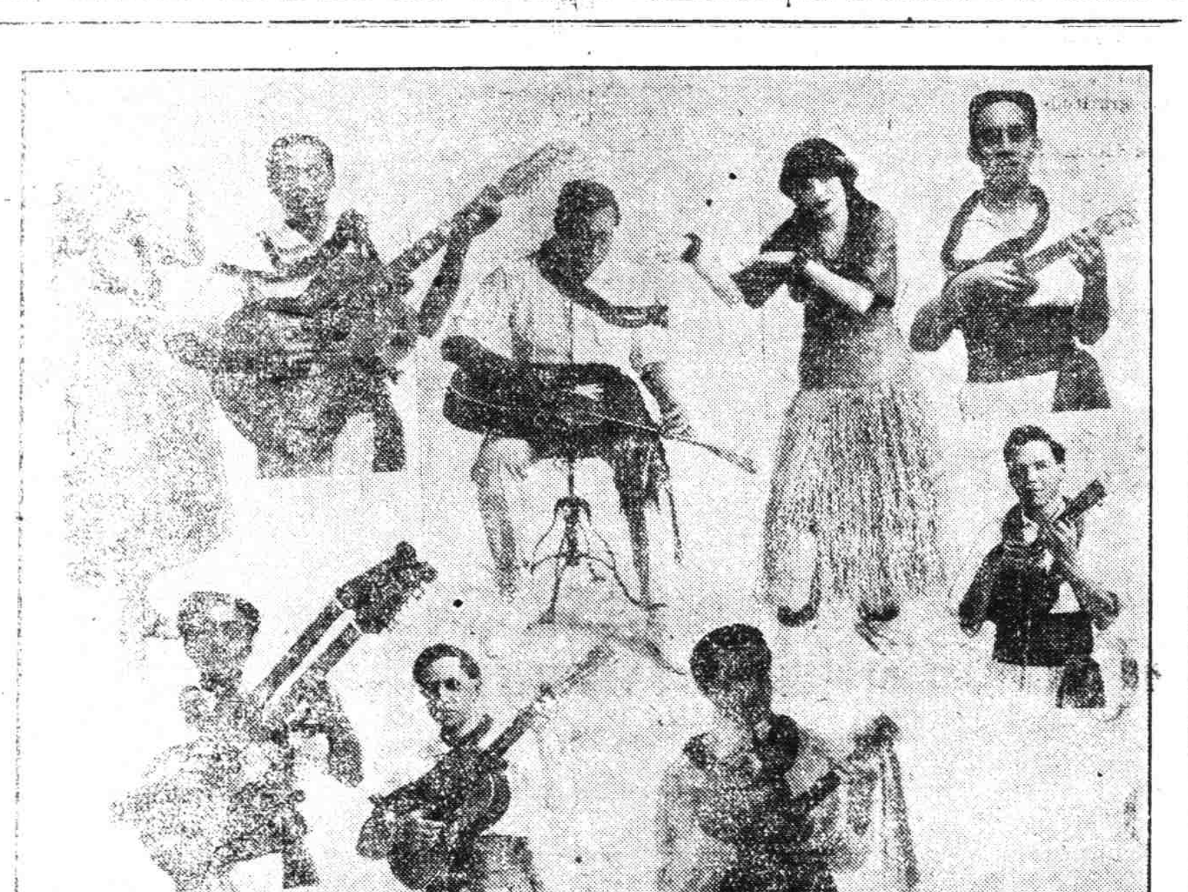
Howarffo Royal Hawaiian Serenaders and Players, the Extraordinary Attraction at the Royal All This Week.

to have a special cya abound our su- urday, November 17, is one of the together delightful. The theme to the suggets, stripped our action most tuneful concoctions of fun and song, "You're In Love" runs through sales to the Atlantic," and so melody heard in many a day. The the entire score and is surely capti in a very anator a n. w and fresh same reliable reports credit the book vating to say the least. Indeed, there conception of the activities, discipling as being considerably out of the geneseems to be not a song number bu what will survive quite as long as