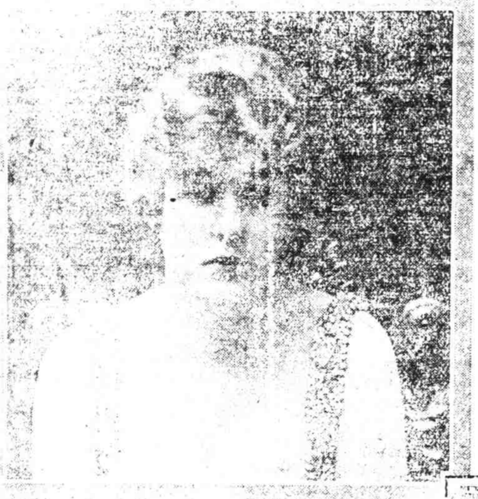
REMINISCENCE "THE SLACKER"