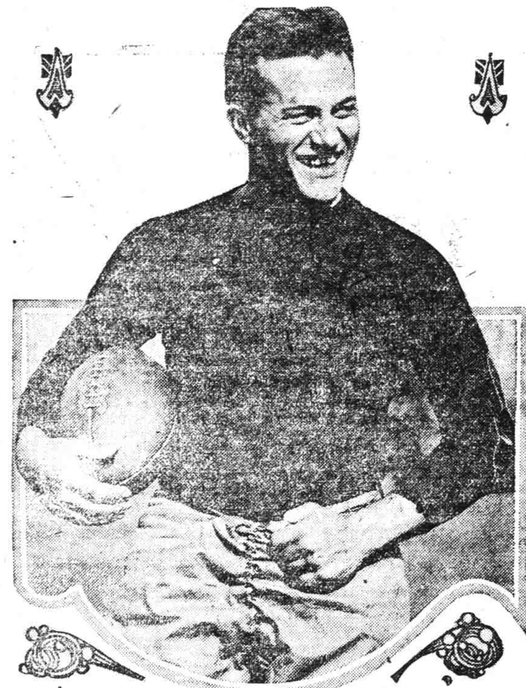
Former Harvard star, now at Camp Upton