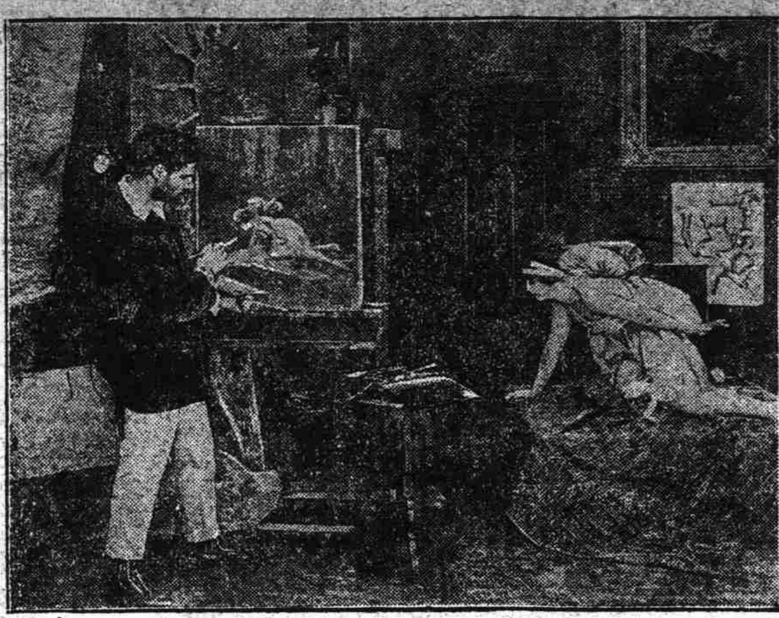
A Scene From Lois Weber's Sensational Allegorical Cinema Spectacle, "Even As You and I," Coming to the Grand in the Near Future.