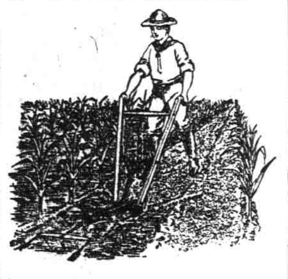
Figure 3 in Operation

For late cultivation, to keep down the final growth of weeds and vines and to break the hard crust forming after rains, only the long lower Blades are used. These Blades move parallel to and above the roots of the crop, which toward maturity come close to the surface. The Cultivator Blades do not injure these roots although completely destroying all grass, weeds and vines. Other cultivators run across the crop roots and deep enough to destroy many of them, making late cultivation with such tools impossible. When crop roots are damaged the energy of the plant is devoted to restoring such roots before further developing either stalk or fruit. It is late cultivation which gives that final complete maturity to the crop so necessary to a maximum yield,