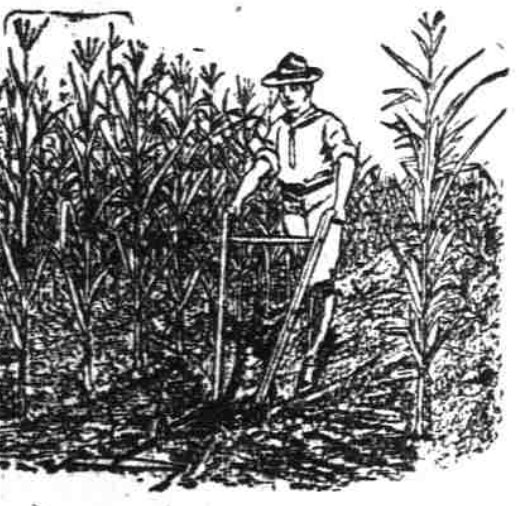
Figure 4 in Operation

A Strong Guaranty With Each Fowler-It Will Do More Work and Better Than Any Other Unless otherwise specified the Fowler is shipped with 32-inch Blades which, by means of the expanding lever, can be made to cut various widths of from 30 to 40 inches. The extra Short Blades shown in Fig. 3 is also shipped with every Cultivator. Longer or shorter Blades covering any width from 15 inches to 45 inches will be furnished if preferred. nished if preferred.