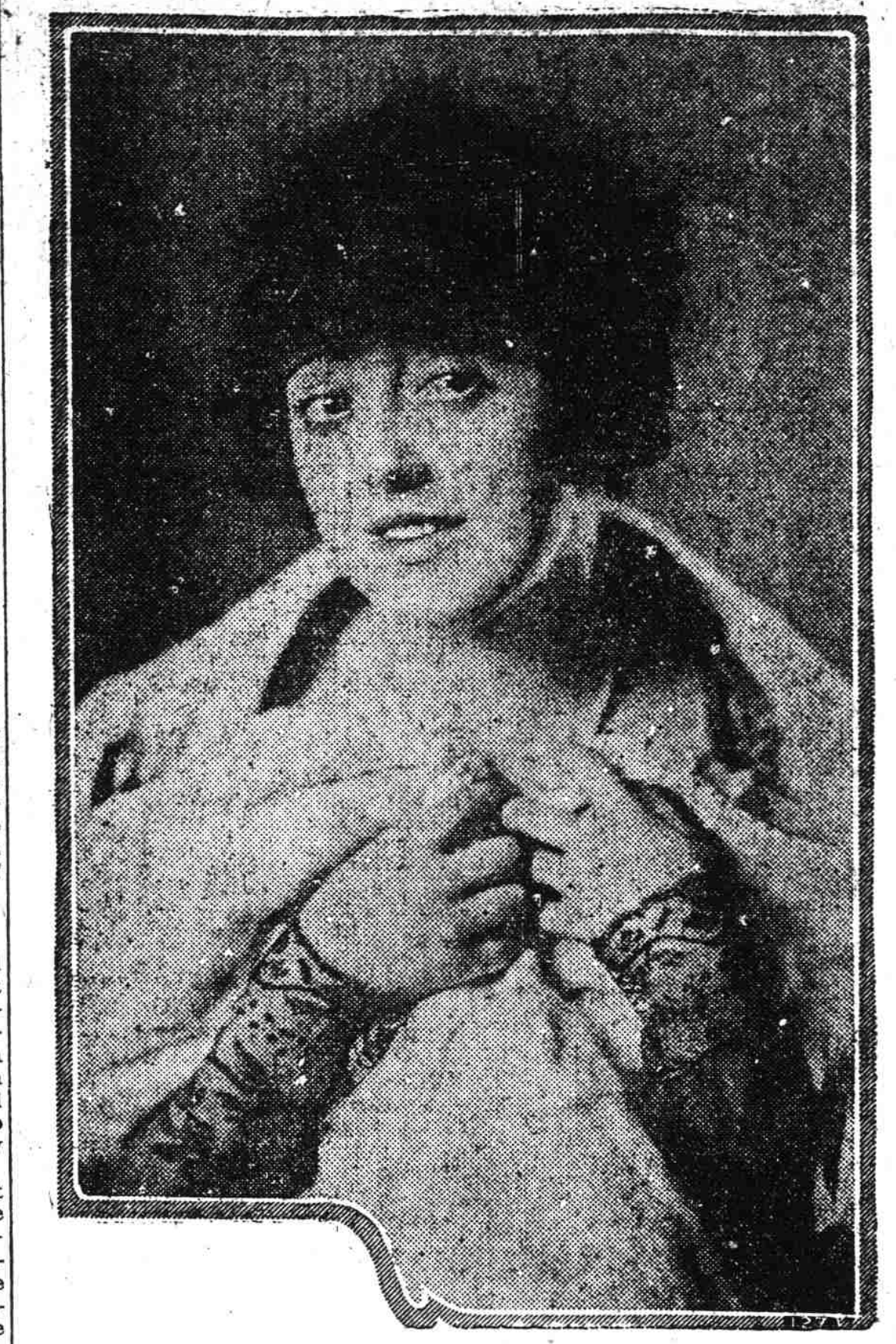
MABEL NORMAND In Her First Goldwyn Production, "Dodging a Million," at the Grand Today and Tomorrow.

San Francisco, Cal., March 25.—Delegates to the quadrennial session of the general or world conference of Seventh Day Adventists, which is to open in this city this week, have begun to arrive and many have reported