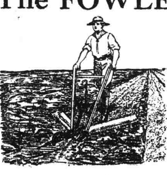
Figure 1 in Operation