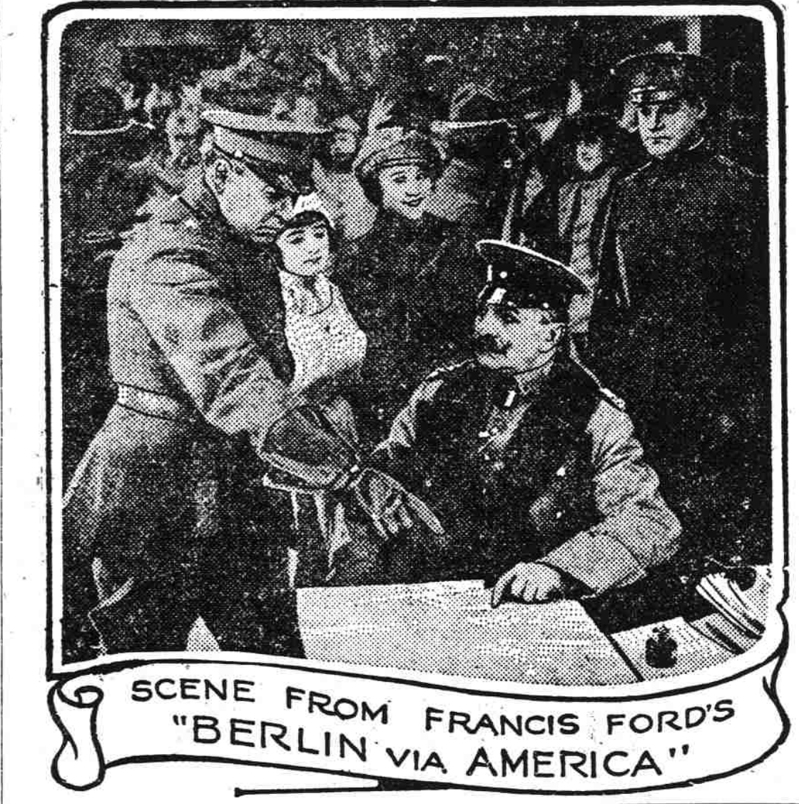
SCENE FROM FRANCIS FORD'S "BERLIN VIA AMERICA"

pete with Brazil in shipping. It will be many years before she is able to overcome the lead in shipping which Brazil has acquired so rapidly.