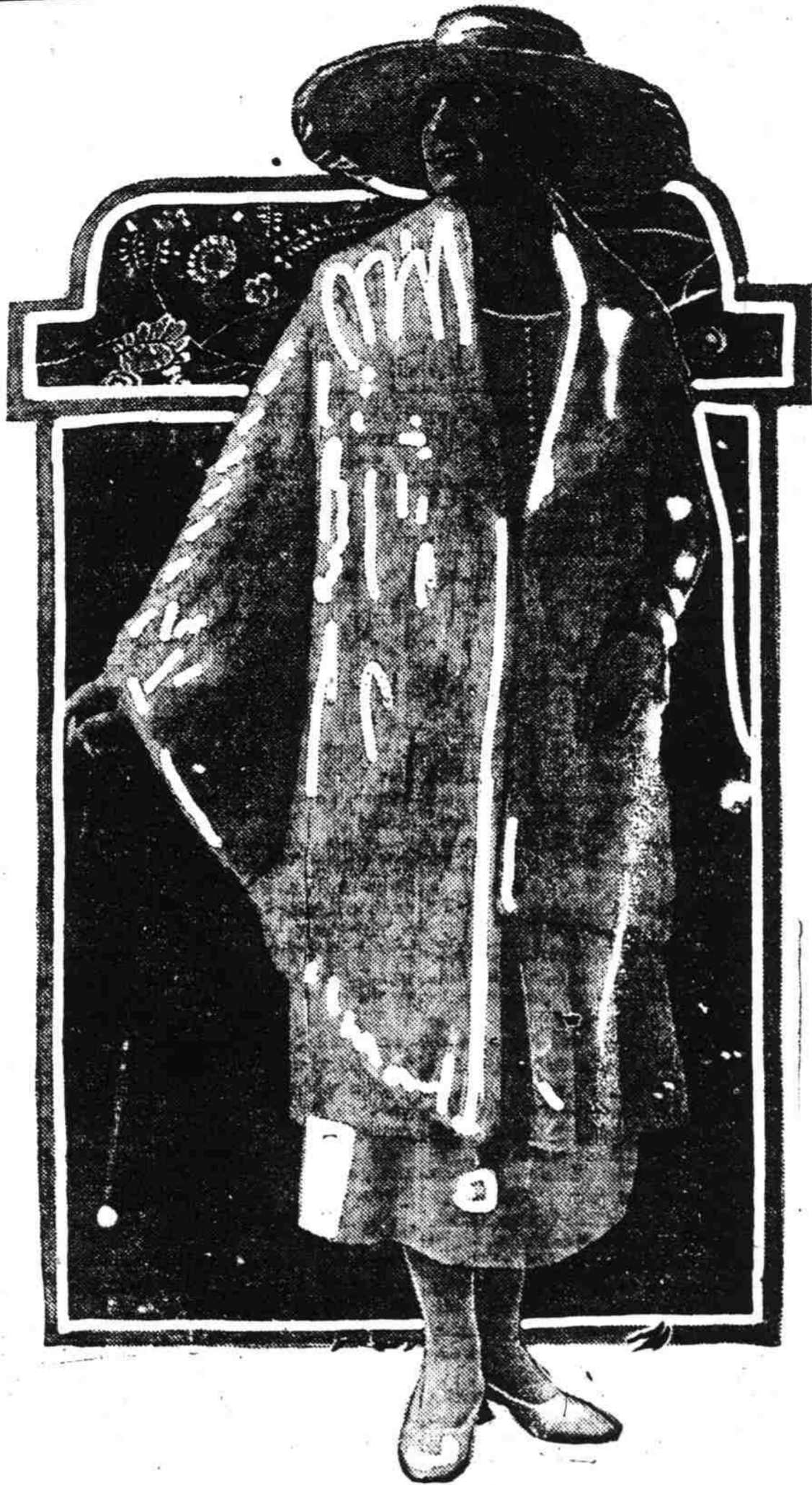
THIS FUR WRAP IS JUST THE THING FOR A COOL SUMMER EVENING.—Both becoming and distinctive is this interesting fur of tailless ermine. Surely nothing could be more attractive for a cool summer evening.

All persons paying The Dispatch subscriptions to agents are cautioned to notice the label on their paper to see if they are given proper credit. The label shows when the subscription expires and if within a few days after making payment your label does not show the proper extension of time notify the circulation department and it will be given immediate attention. CIRCULATION MANAGER, The Dispatch.