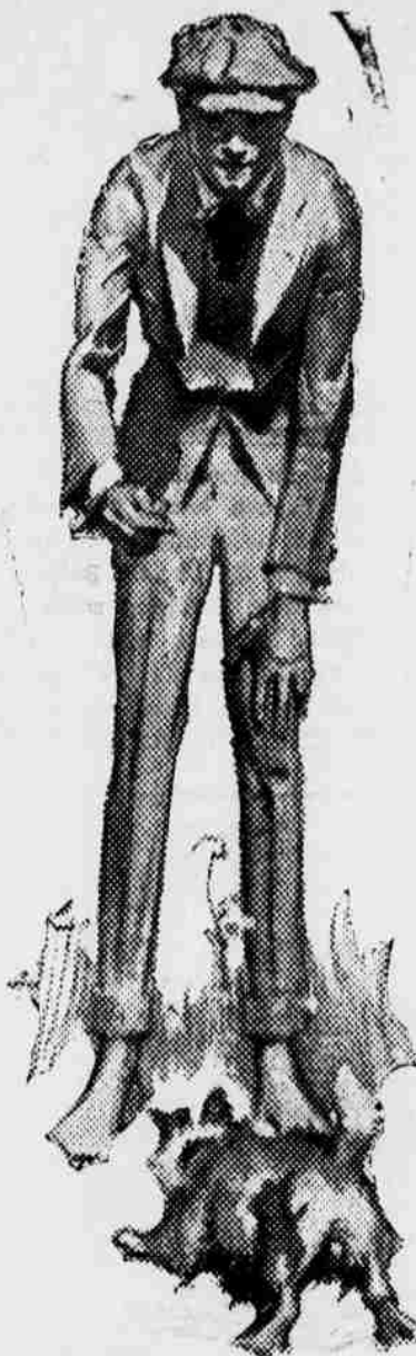
Copyright 1918 Hart Shaffner & Marx