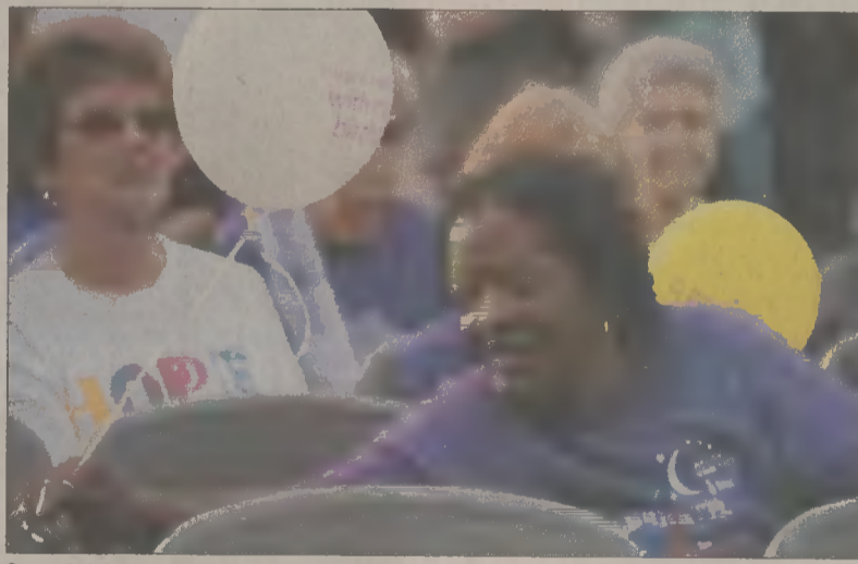
One of the many cancer survivors at Friday's opening ceremony reaches for a balloon given to each survivor in attendance.

"I have helped with Relay for Life working with the schools and have had cancer affect those in my family, but I never imagined I would get a diagnosis of cancer," said