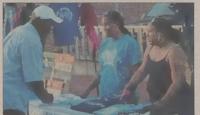
Vendors are a major part of each Sage Festival.

Send Your Graduate off to College with a Little Piece of Home