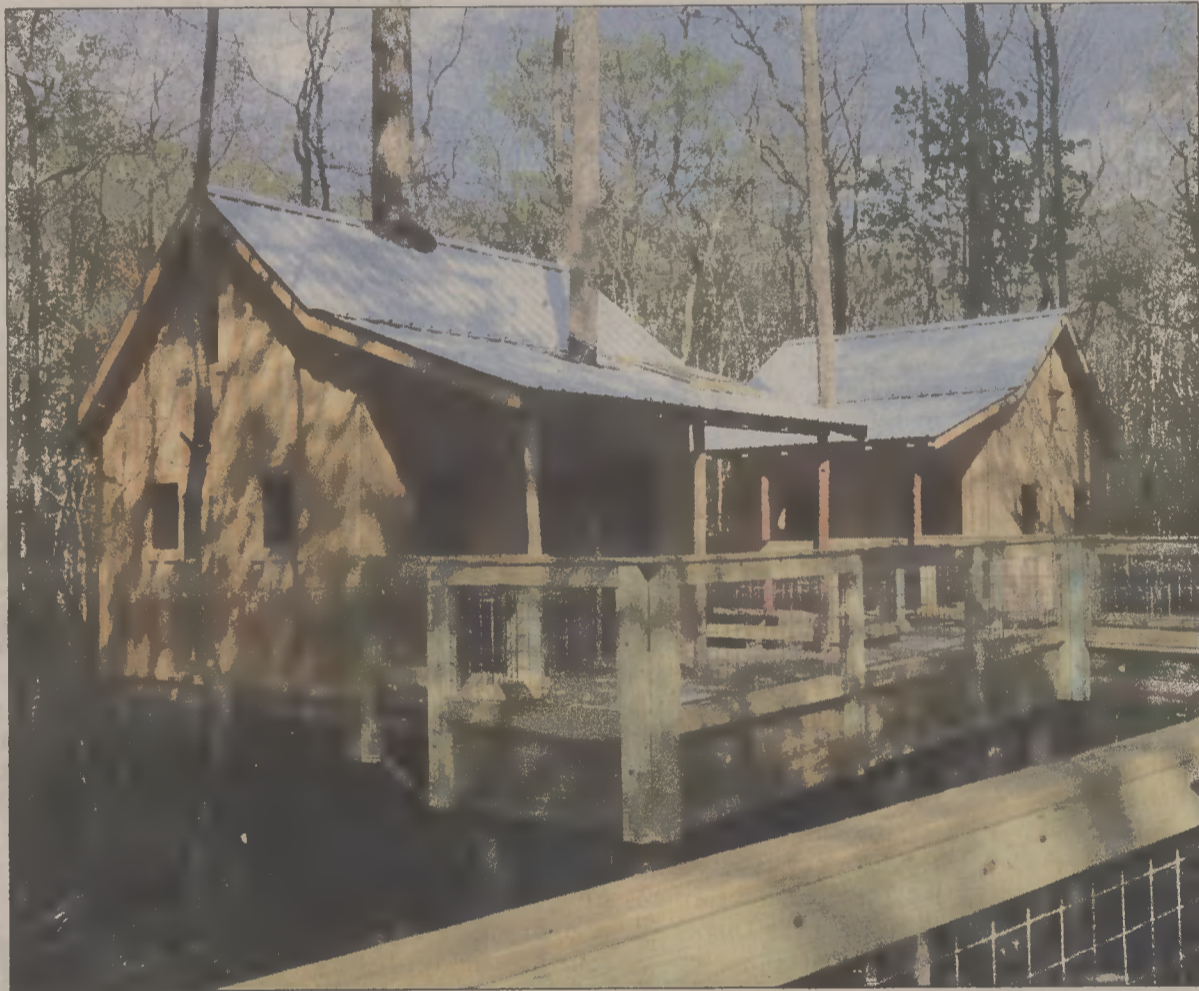
JAY JENKINS / N.C.'s Eastern Living Magazine