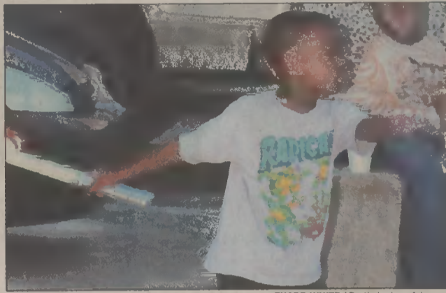
THADD WHITE / Bertie Ledger-Advance