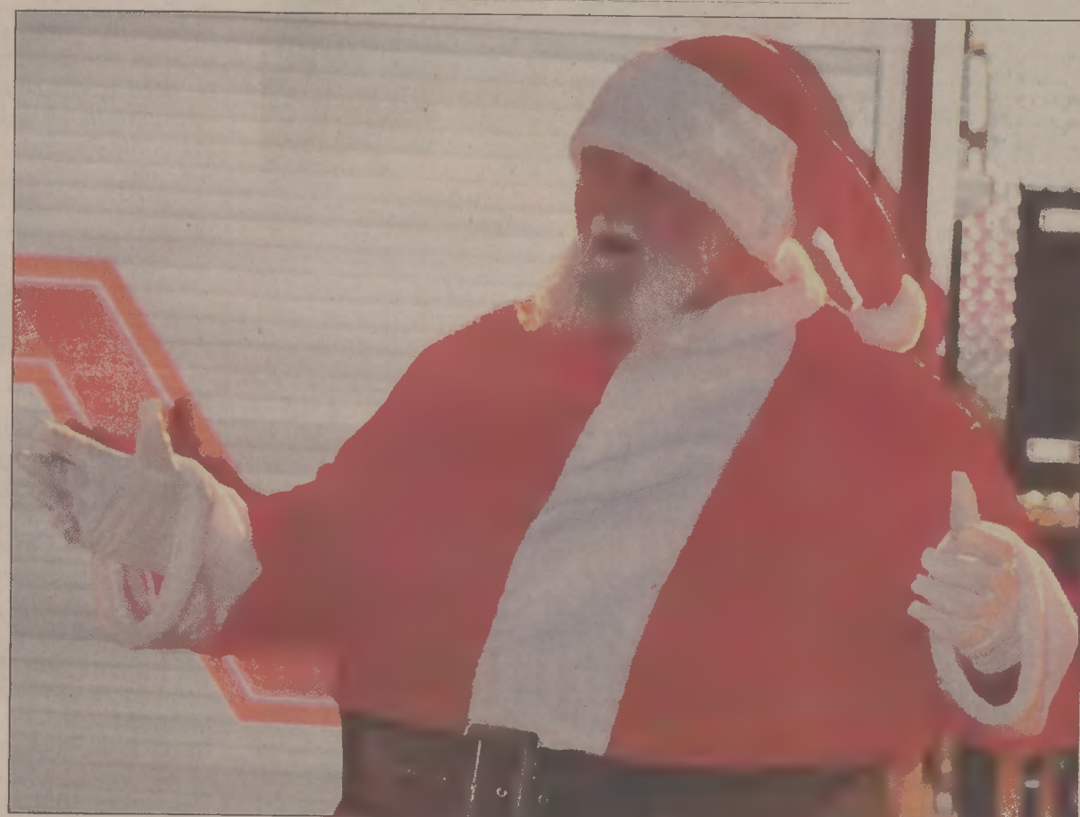
Santa Claus gives a friendly greeting as he arrives to Saturday's event courtesy of the Roxobel Fire Department.