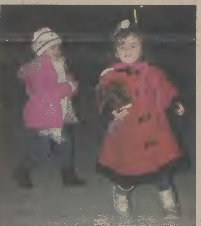
Youngsters play during the time just before the Peanut Drop on New Year's Eve.