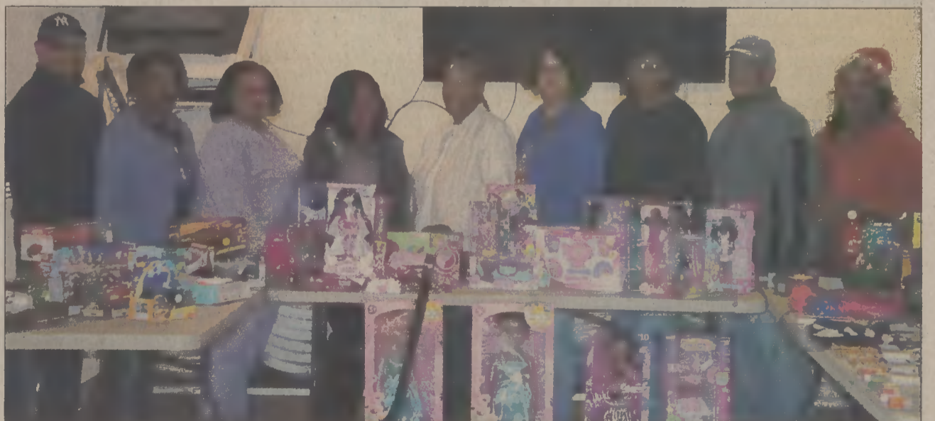
Members of the George W. Lee Lodge and Daughters of Excelsior Temple prepared to give away toys to flood victims.