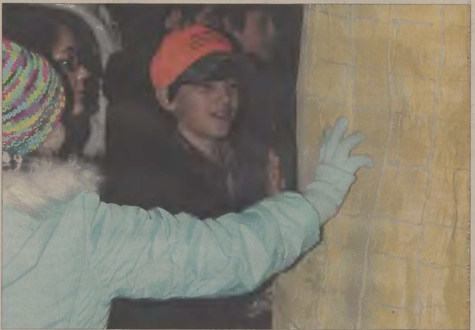
Some of the children who attended the inaugural Peanut Drop touch it after it was dropped at 9 p.m. Saturday night.

The crash is still under investigation, and charges are pending, police said.