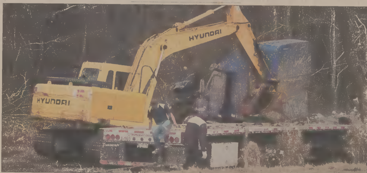
LESLIE BEACHBOARD / Bertie Ledger-Advance