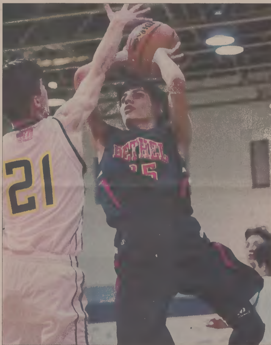
ANDRE ALFRED / 2nd Chance Productions