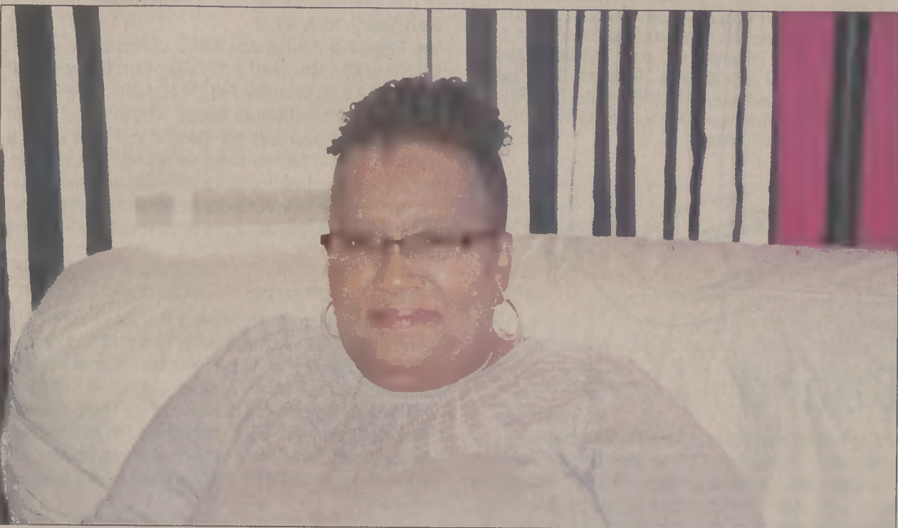
LESLIE BEACHBOARD / Bertie Ledger-Advance