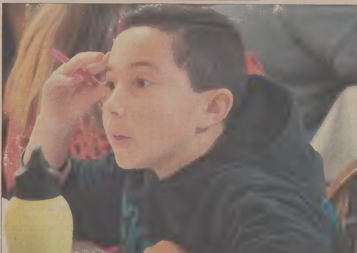
A competition participant tries to figure out the answer to a bonus question.