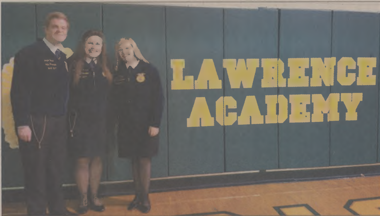
Lawrence Academy recently re-established its Future Farmers of America Charter.

In their presentation, the NCSU students explained the benefits of FFA participation including leadership opportunities, state and national conferences, networking opportunities, internships and a wide array of career