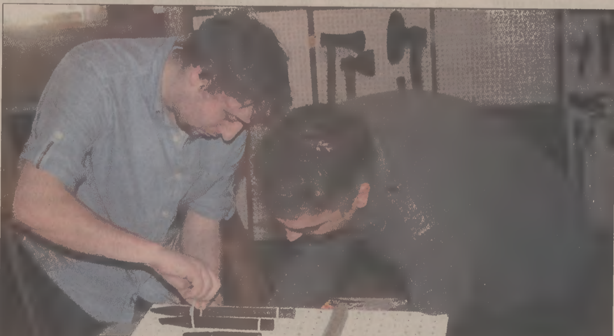
Two members of the CREST team work on a display of tools at the Farmer's and Craftsman Museum.