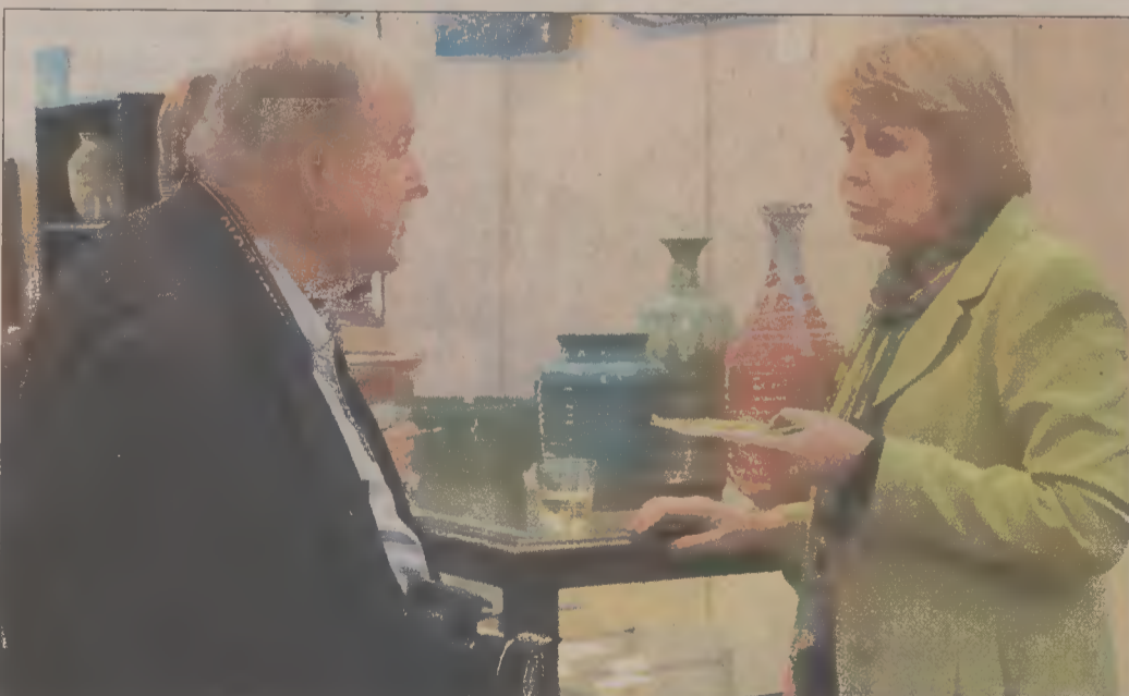
LESLIE BEACHBOARD / Bertie Ledger-Advance