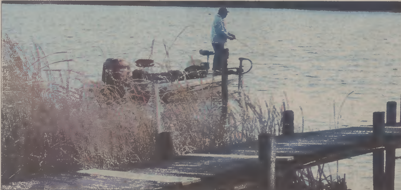
A man fishing off of his boat on the Sans Souci River.