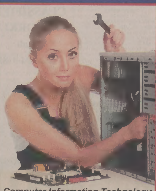
Computer Information Technology

Learn more at 252-792-1521 or www.martincc.edu