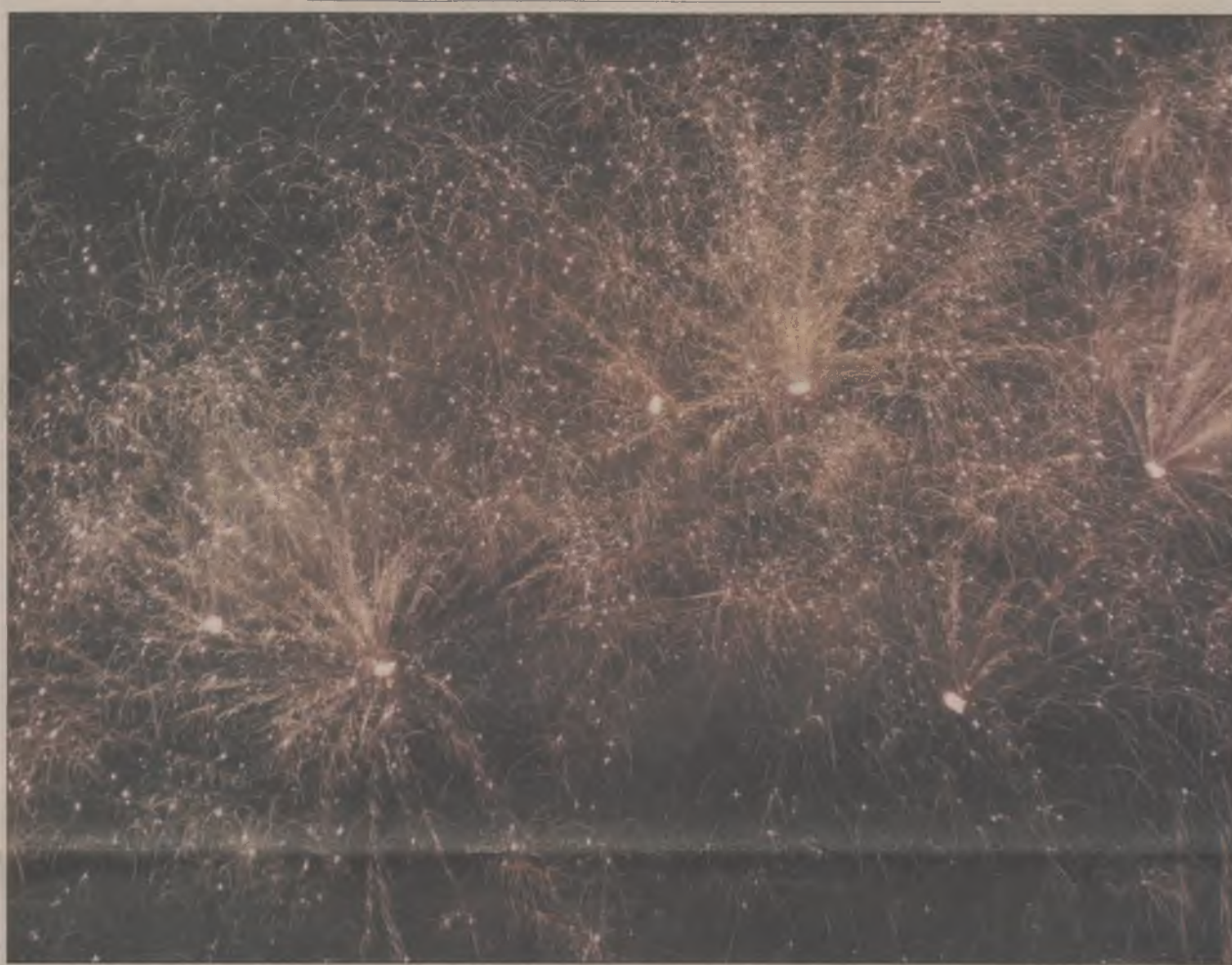
Fireworks will fill the skies of Windsor Monday night during the annual July 3 celebration.