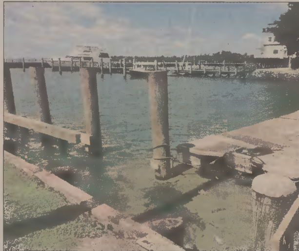
An algal bloom has invaded the waters by Edenton Bay.

According to a state DEQ, Chowan County’s algae bloom extends along the eastern side of the river from the Arrowhead Beach area south to Edenton, then continues east hugging the shoreline until just beyond the N.C. 32 bridge.