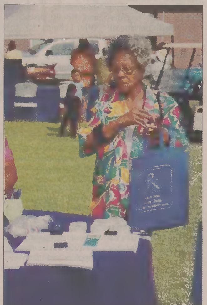
Greater Wynns Grove Community Development Center held its annual community day Saturday at the Greater Wynns Grove Baptist Church in Colerain. The event featured a parade, food and games for children and adults. Pictured, clockwise from top: Colerain Elementary School students get ready to march in the parade; A woman visits the Seniors Health Insurance Program (SHIP) booth; bingo was one of the popular events; cooks prepared a variety of foods, including barbecue chicken.