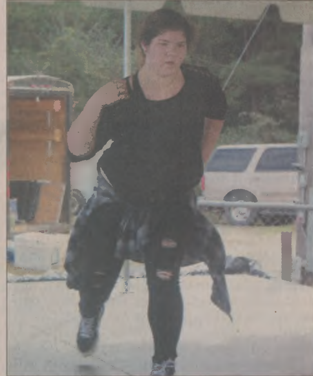
A teenager from Hope's School of Dance entertains the crowd Saturday morning.