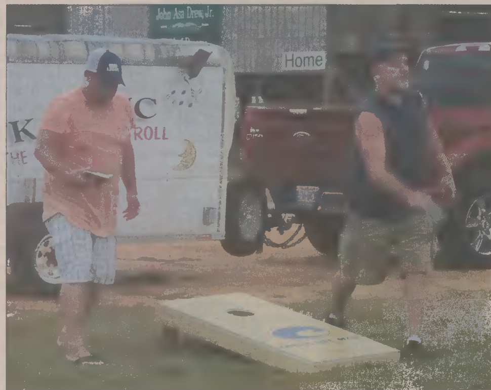
The Cornhole tournament continues to be a favorite event of those attending the festival.