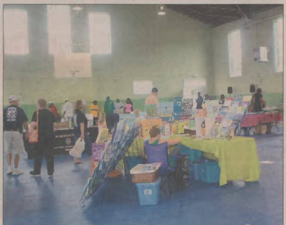
There were craft goods available for everyone in the Acree Gymnasium.

TIME TO START GETTING IN SHAPE.... 8th Annual Bertie Spooktacular Saturday, October 28, 2017