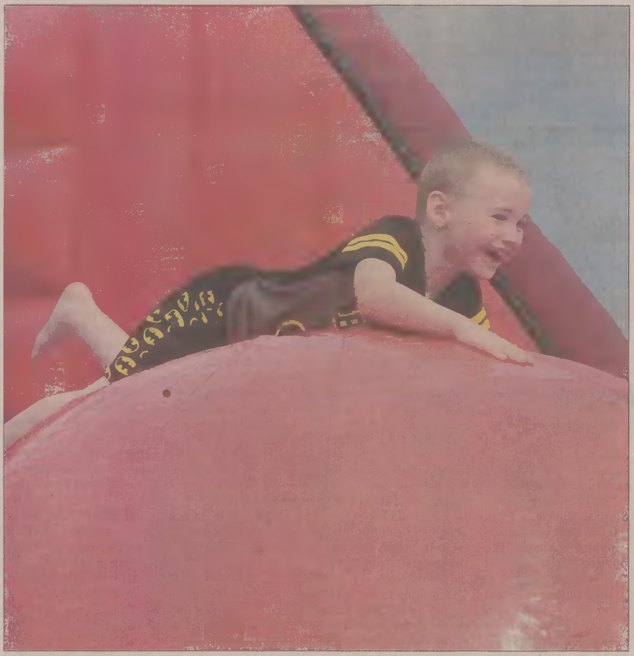
Smiles were abundant as children enjoyed the opportunity to play most of the day at the peanut festival.