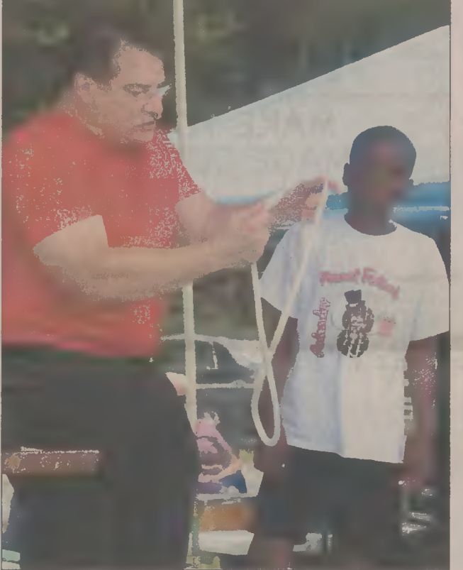
Kringy Magic allowed youngsters to get a close-up view.