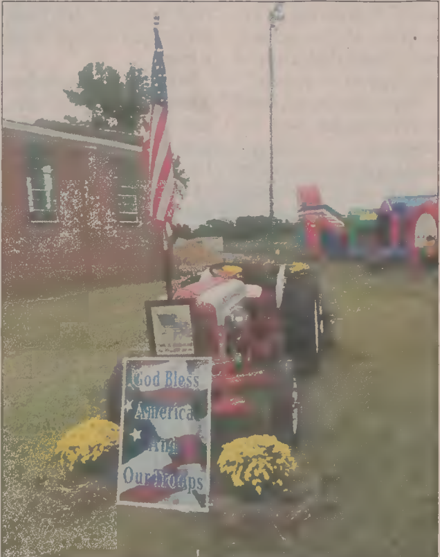
A display of American patriotism at the Aulander event.