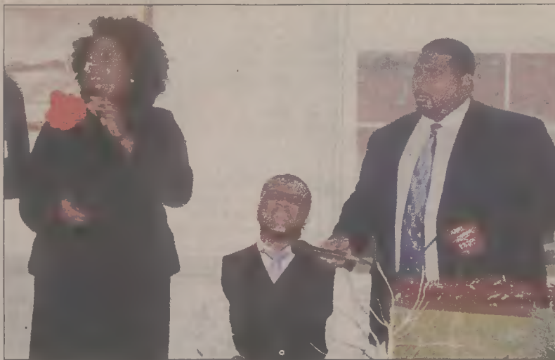
The Singing Morticians gave a mini-concert filled with Christmas music Saturday afternoon at the Aulander Community Building. Despite the parade being cancelled, Aulander citizens still celebrated.