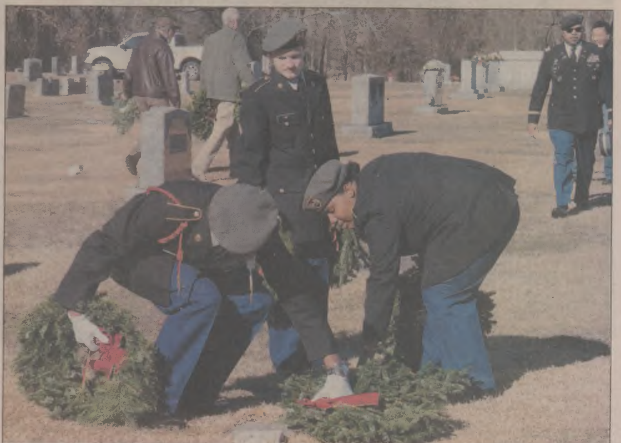
Bertie High School JROTC students participated in laying wreaths on Veteran's graves at Edgewood Cemetery during Wreaths Across America.