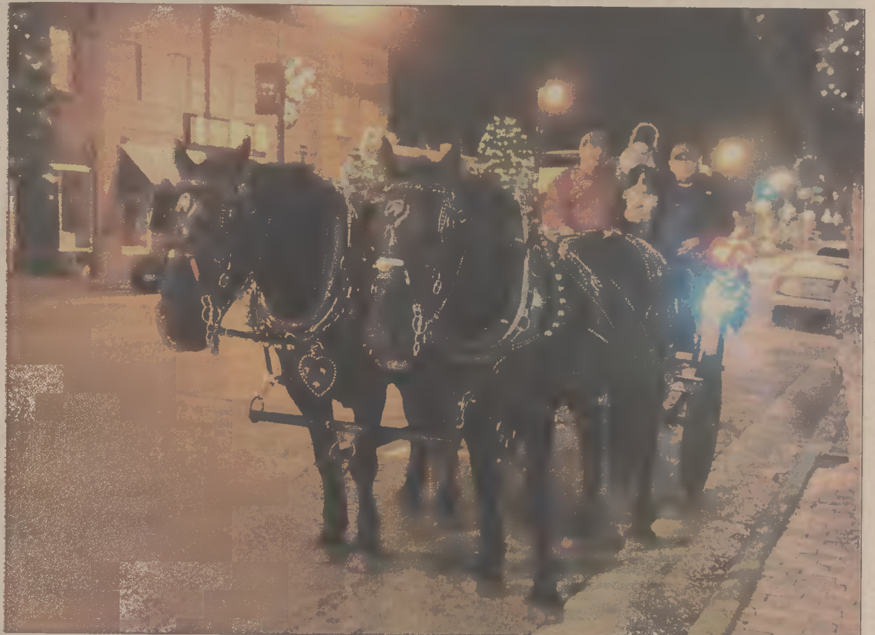
Horse drawn carriages filled the streets of Windsor giving riders a view of the town's Christmas décor.