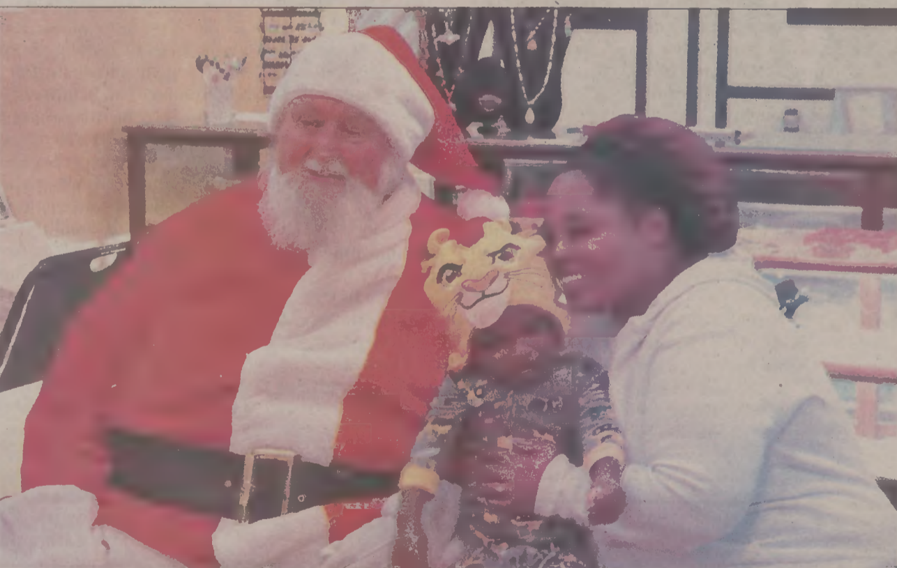
Santa Claus was available for pictures at the Bertie County Arts Council on Tuesday, Dec. 5 during the carriage rides.