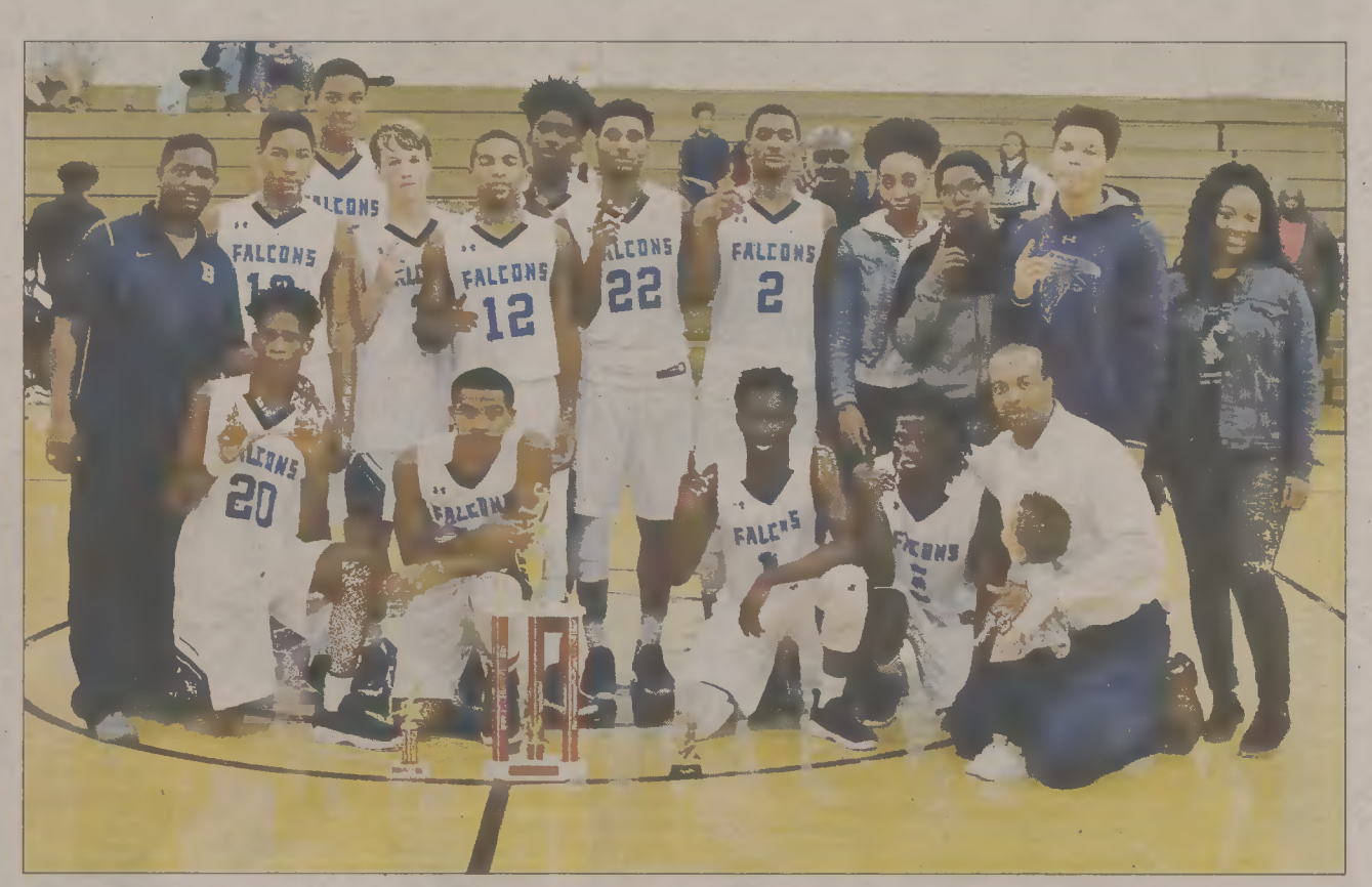
The Bertie High Schools boys are the inaugural Cooke Communications Holiday Invitational Tournament champions.