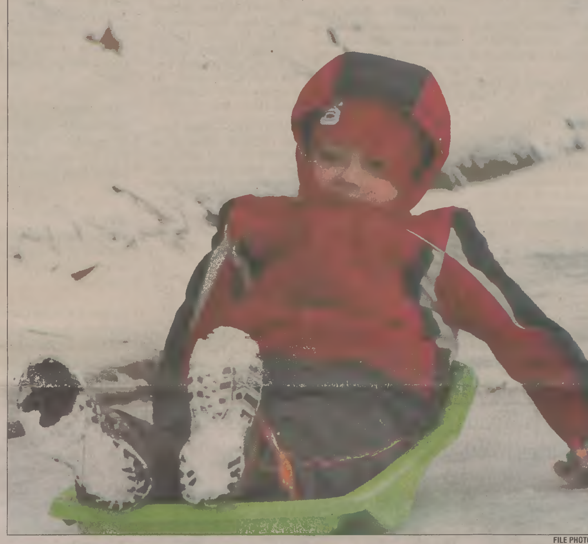
If the weather forecast remains, Bertie County's little ones will have the opportunity to play in the snow this week.