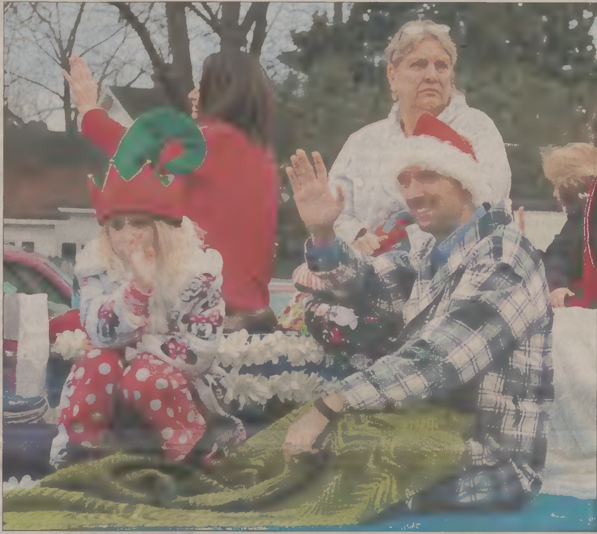
Vidant Bertie and Vidant Chowan hospitals were involved in a variety of community activities in 2017, including the Windsor Christmas parade.