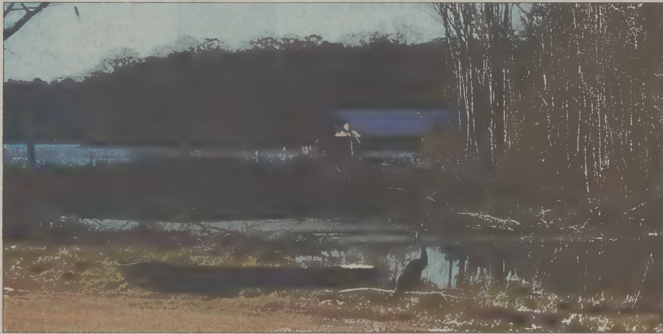
Scenic view of the river at Sans Souci.