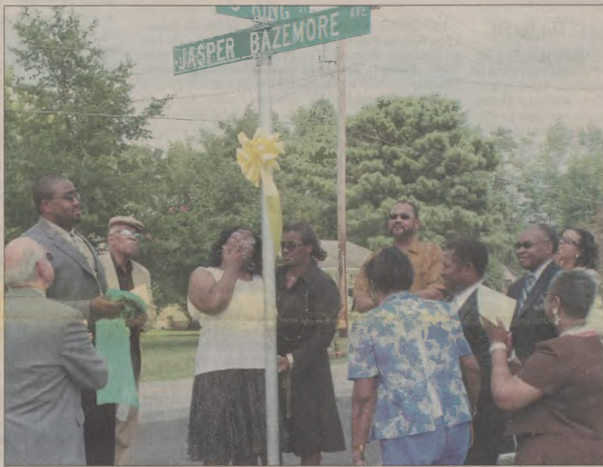
Officials and family members unveil Jasper Bazemore Avenue as a tribute to the longtime public servant.