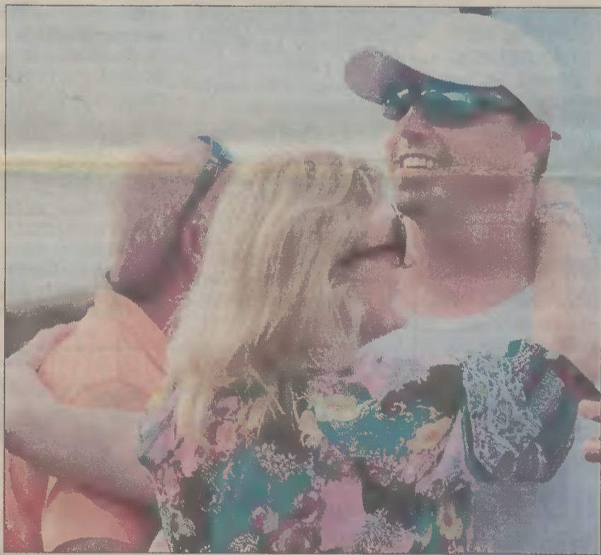
Many of those in attendance danced on King Street.