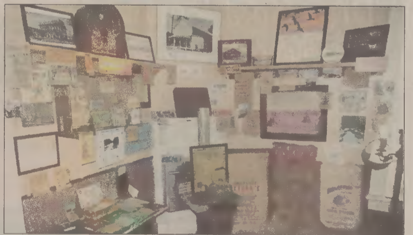
Russell's Back-in-the-Day Museum is one of three historic museums open Fridays and Saturdays in Windsor.

The first of the town's museums is the Windsor Farmer's and Craftsman Museum, which is located on the corner of Granville and York streets near Liv-