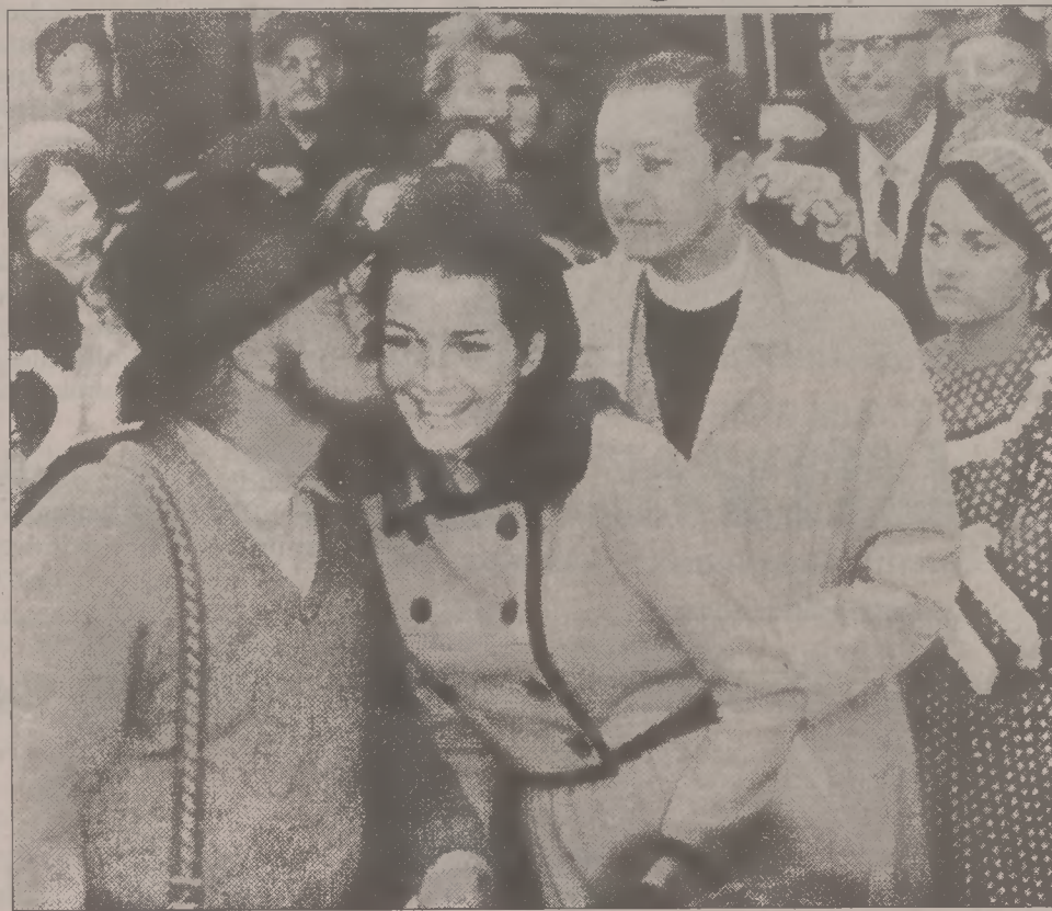
The winner of the Beard Growing Contest at the 200th Windsor anniversary celebration gives a kiss to Miss America.