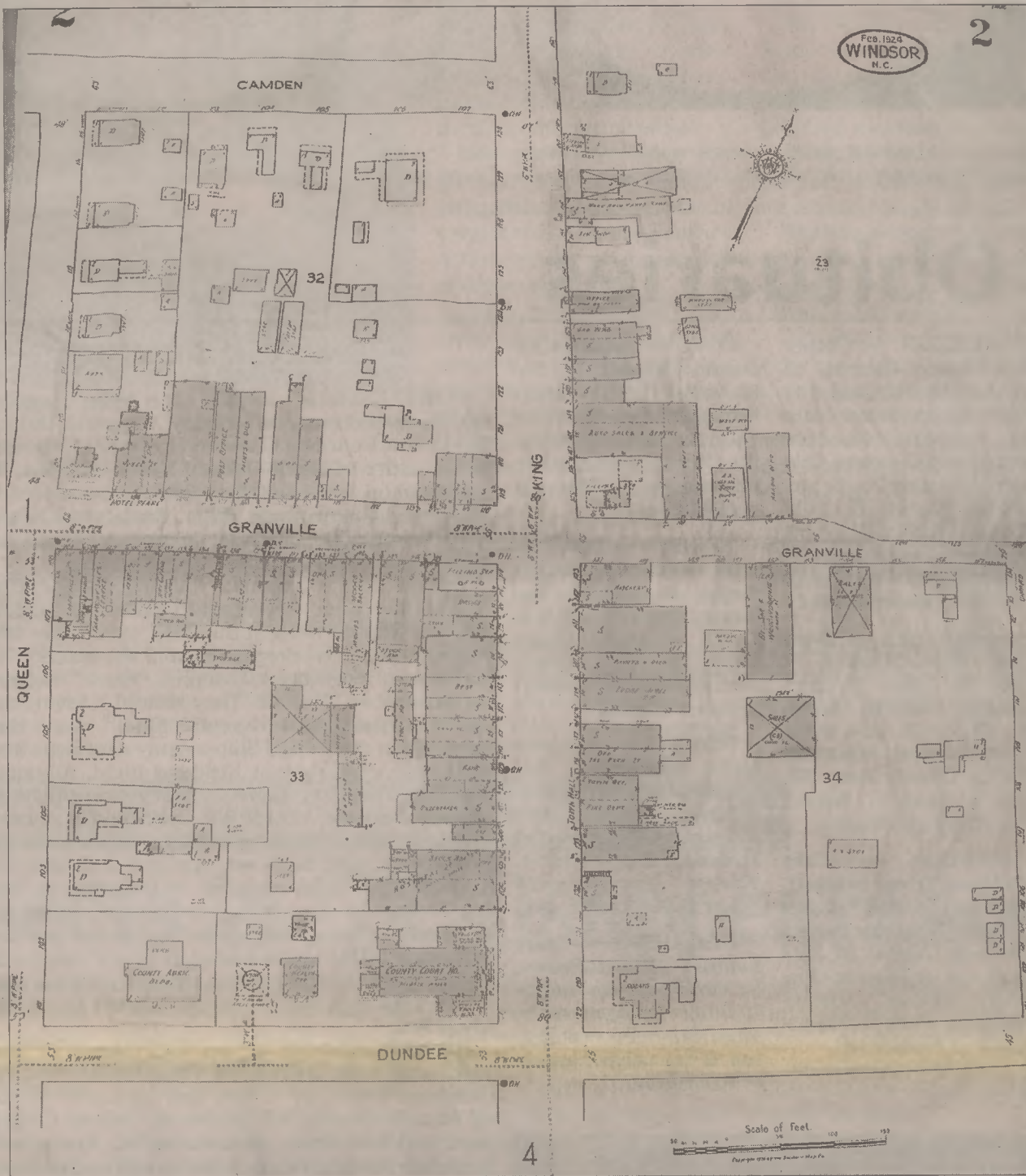
This map of downtown Windsor is part of the historic past of the town, which is on the verge of celebrating its 250th year. Currently, The Windsor Story, Volume II is being put together and submissions are being sought showing parts of the long history of the town.