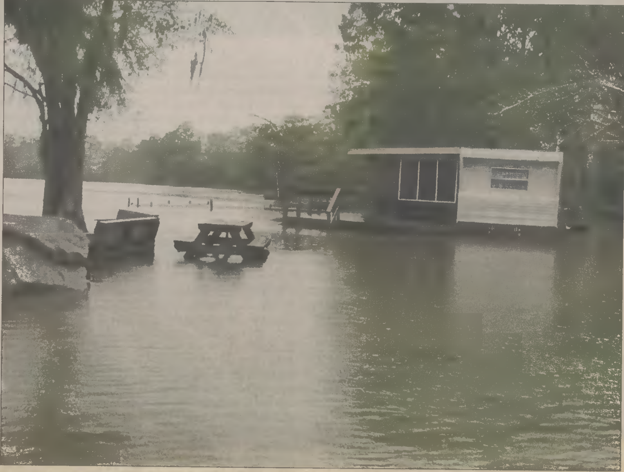
Water surge from the Albemarle Sound created flooding situations near the Sans Souci Ferry. The Cashie River is expected to remain below flood stage as most of the county received less than 10 inches of rain.