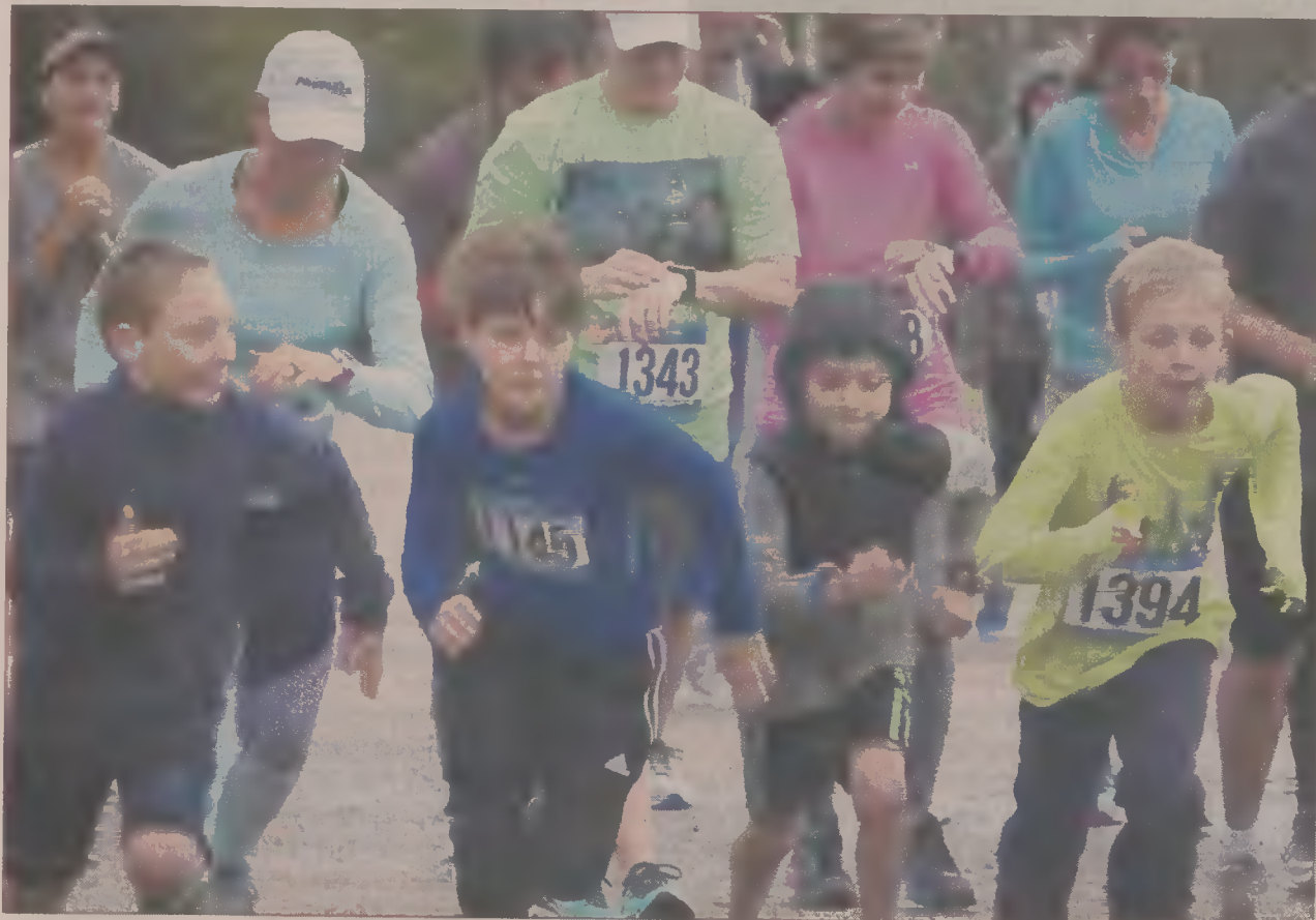
Racers begin the Spooktacular 5K Saturday on York Street in Windsor, led by a group of younger runners.