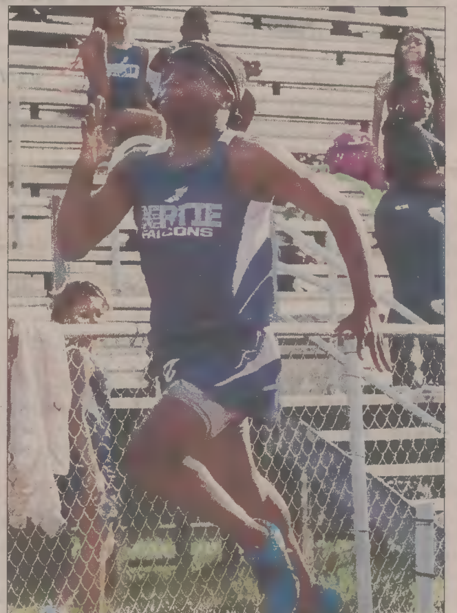
ANDRE ALFRED / A.A. Imaging