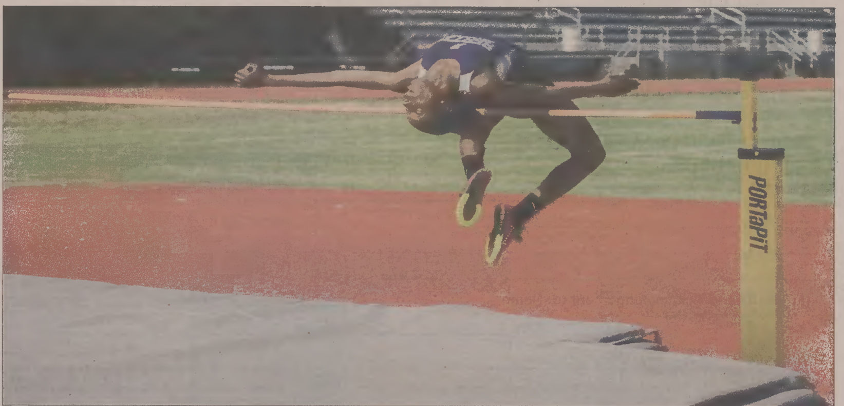
ANDRE ALFRED / A.A. Imaging