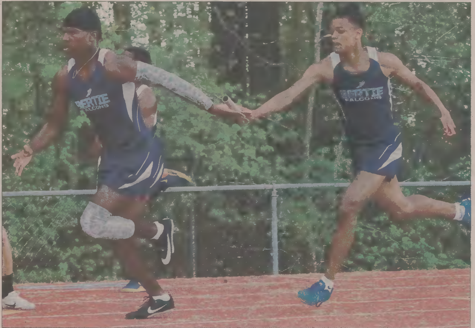
ANDRE ALFRED / A.A. Imaging