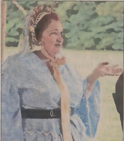
A female reenactor dressed in time-era clothing explains the importance of camp's kitchen and preparing meals for the soldiers.

gram was the encampment of Federal and Confederate reen-