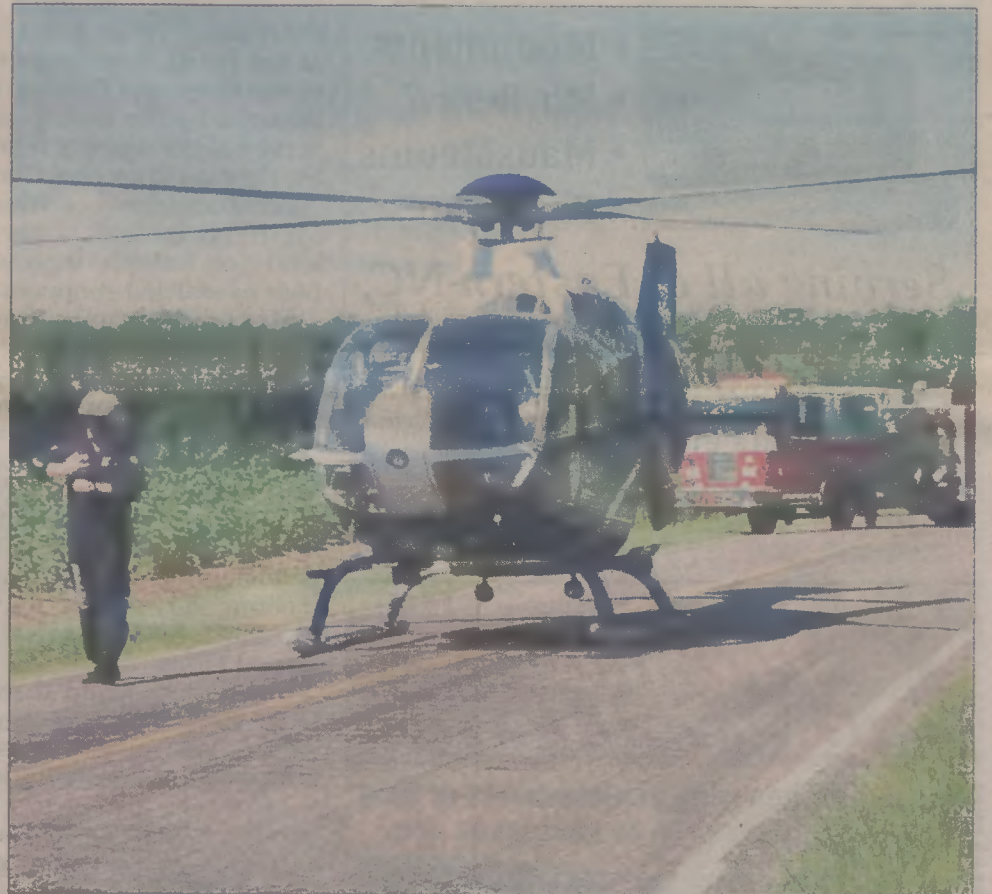
EastCare landed at the scene of a one-car accident Monday near Kelford.