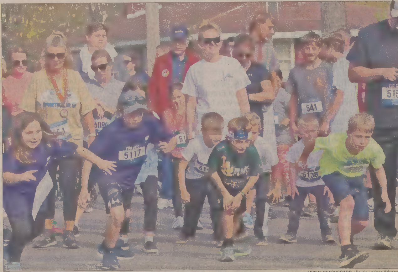
LESLIE BEACHBOARD / Bertie Ledger-Advance