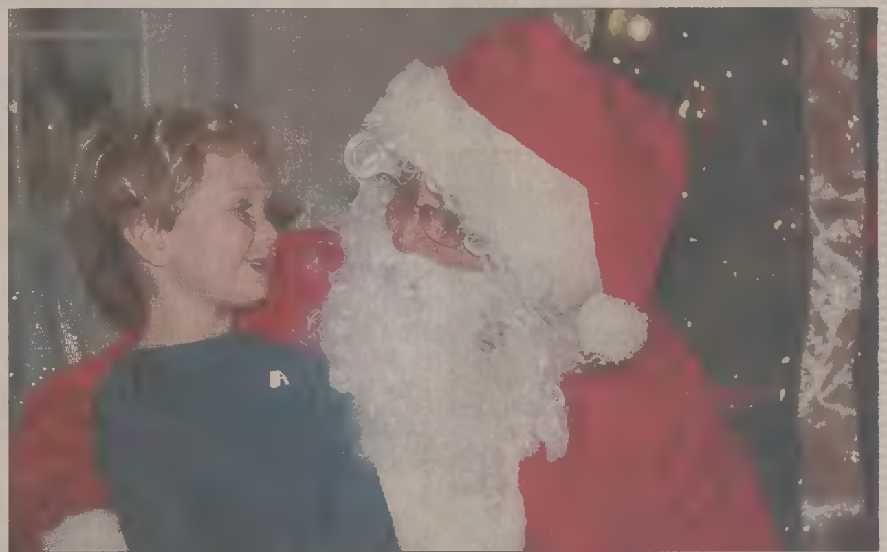
In addition to talking to Santa directly, youngsters can send him a letter through the Bertie Ledger-Advance.